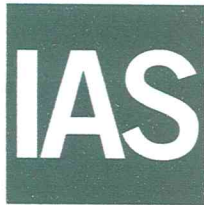
King Cert International Certification Ltd. Director

ACCREDITED Management Systems Certification Body MSCB-196